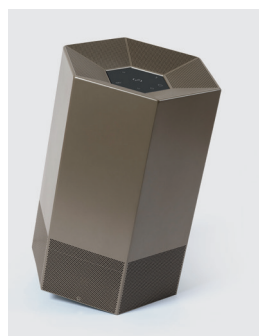
Bronze REF. 8 77 2127-BR