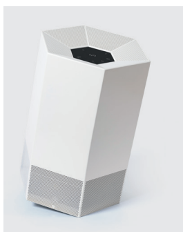
Cream white REF. 8 77 2127-WH