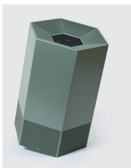
Malachite green REF. 8 77 2127-GR