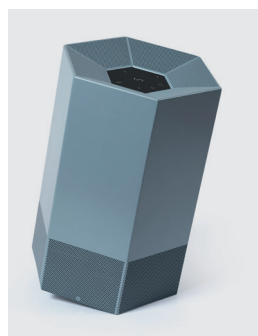
Sapphire blue REF. 8 77 2127-BL