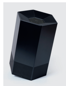
Matte black REF. 8 77 2127-BK